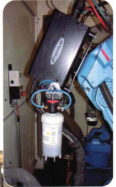
MOTOMAN Robot Welder 44 St-Aignan-de-Grand-Lieu