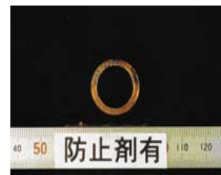
Spatter adhesion is almost none existent when Spatter Shield™ is used.