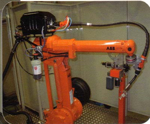
ABB Robot Welder - 95 St Ouen l'Aumône